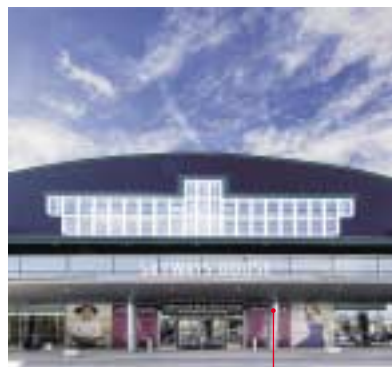
Speke Aerodrome Littlewoods headquarters

To support the expected growth of on-line retailing Littlewoods Shop Direct Group has a highly valuable and efficient infrastructure that no other UK retailers can rival sourcing, warehousing, single pack distribution and home delivery to customers.